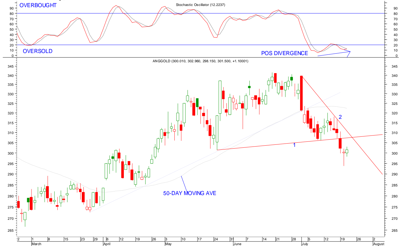
Chart 5. (Daily)

Chart Setup: Very similar the two preceding charts, Anggold have fallen over the past month and is showing signs of making a bottom. One such sign was a classic reversal candle up on Tuesday.