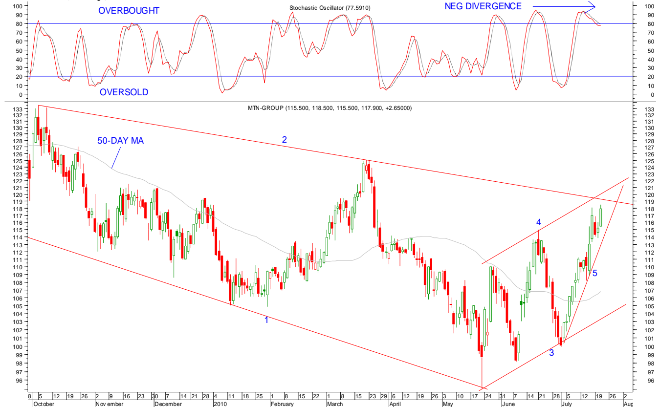
Chart 7. (Daily)

Chart Setup: MTN is in a large broadening formation (or megaphone) (lines 1 and 2). It has now rallied to retest line 2 (R119 level). Lines 3 and 4 from a channel. There is evidence that this stock is being accumulated by institutions (which makes it a 'buy' for investors on weakness), but right I'm looking for a temporary sell-off.