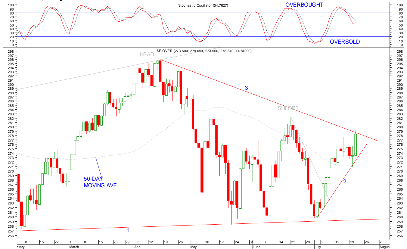
Chart 2. (Daily)

Chart Setup: The index dropped to line 2 as expected from last week's commentary. It reversed up off line 2 on Tuesday and is set to continue higher still. Line 3 has been adjusted to take into account last Friday's 'topping tail' high. A close above line 3 will be a further bullish sign (which is happening today so far).