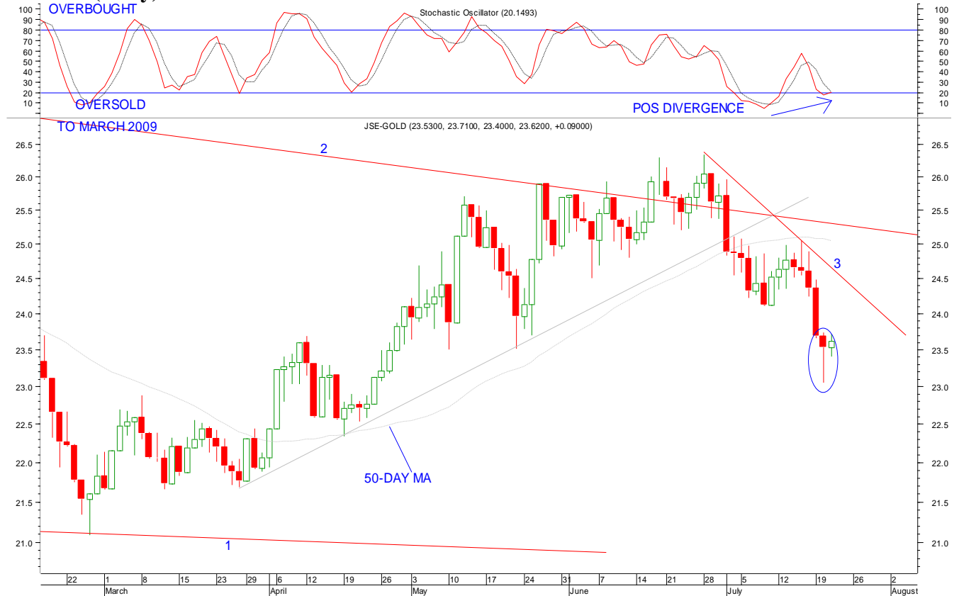
Chart Setup: After falling for a few weeks, the gold index formed a classic bullish reversal candle (a 'hammer'), on Tuesday (see circle).