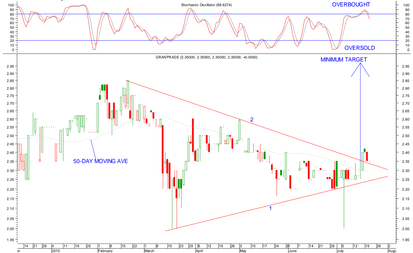
Chart 8. (Daily)