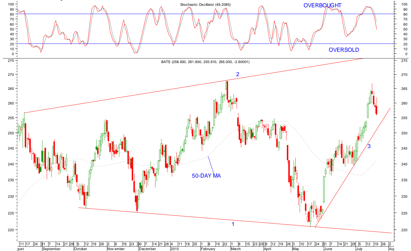
Chart 6. (Daily)

Chart setup: BTI gave a classic reversal candle down last Friday (a 'shooting star'), which was the signal to sell short (for aggressive traders) as advised in the Notes & Updates section last week. It has dropped nicely since then. It is nearing line 3 support, and I'm expecting a reversal back up from there or from slightly lower.